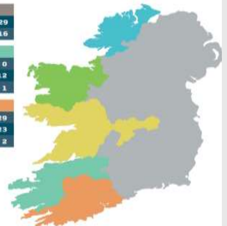
Figure 10: Map of combined salmon output volume (tonnes) and employment by NUTs iii regions in 2023